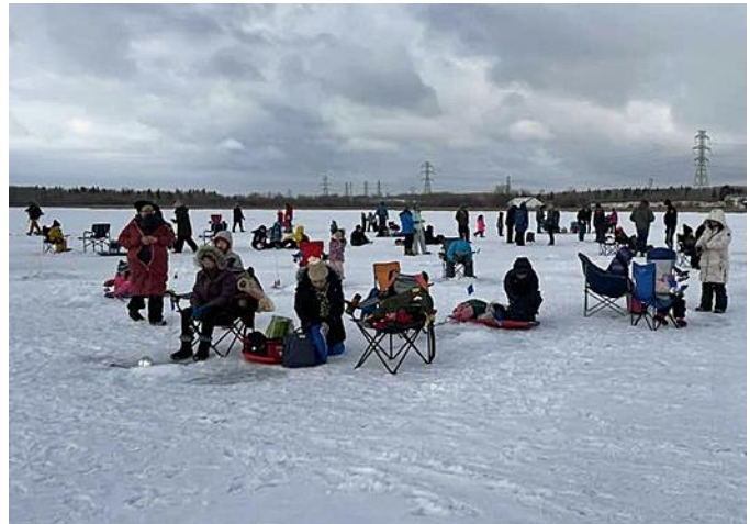
Alberta Conservation Association's Kids Can Catch, Wabamun Lake, Family Day 2023