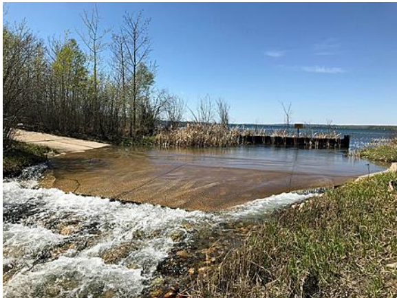
Outflow over The Weir, starting Wabamun Creek

The only outflow from the lake is a small stream at the east end which is governed by “The Weir” a simple depression in a paved road, set at an agreed upon 724.55 metres above sea level. Evaporation plays a much larger role in drawing down the lake than any outflow at Wabamun Creek even when it is flowing.